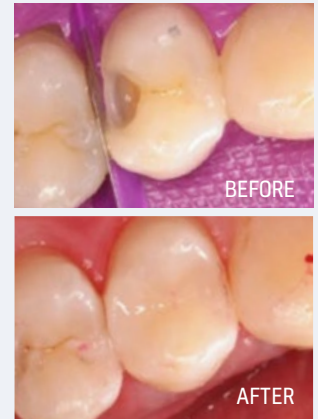
Dr Terry Wong (Australia)

BUY 2 AURA EASY SYRINGES GET 1 AURA EASYFLOW SYRINGE FREE*